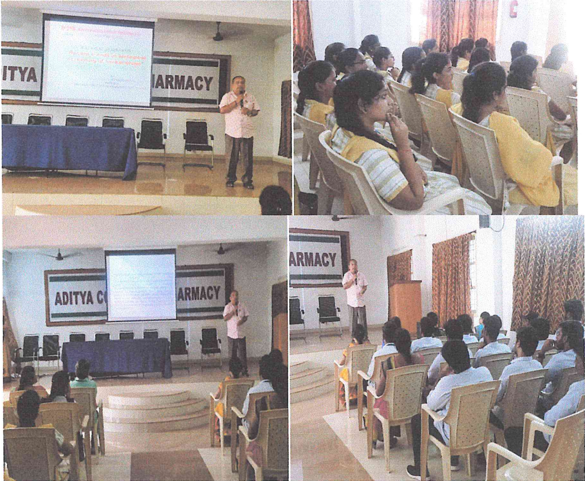
Gallery for the National Seminar Research Methodology